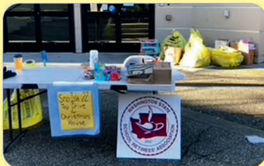
Unit 22 Sno-Isle: Despite the pandemic, unit members figured out a way to hold their annual toy drive as a drive-through event this year, "Parade of Toys." The toys were given to the Christmas House in Everett.

Step one is to present materials to the school district's