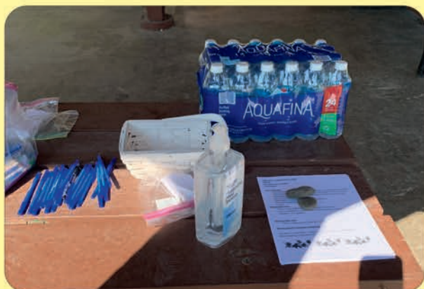
Unit 1 Clarkston/Asotin/Pomeroy: Tools for a successful outdoor, socially distanced, unit meeting - hand sanitizer, bottled water, agendas reminding members to social distance and wear their masks, sanitized pens and a door-prize drawing basket.

cards, sympathy cards, and “thinking of you” cards as to try to encourage members throughout this challenging time.